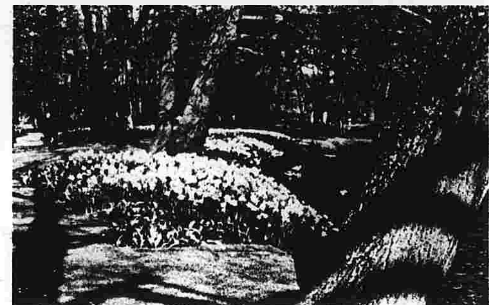
A bank of narcissus beside a stream in the magnificent Keukenhof bulb display garden in Holland. The garden, once a private estate, is maintained now by the bulb growers to exhibit their finest flowers.