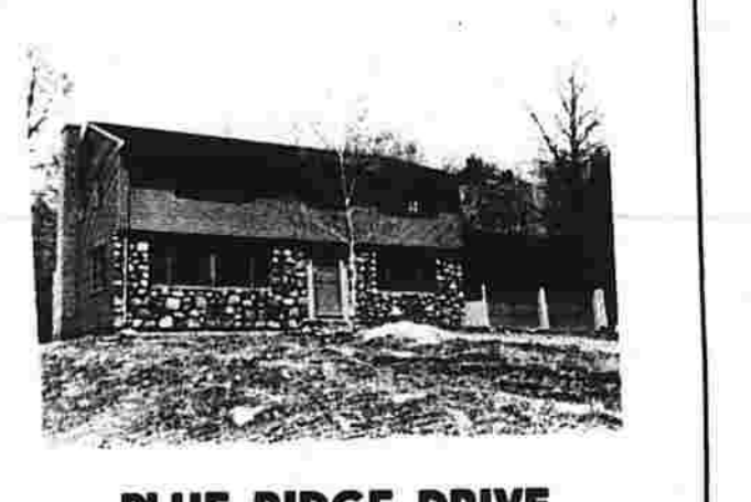
BLUE RIDGE DRIVE MANCHESTER

See this spacious new 8-room Garrison Colonial situated in one of Manchester's finer locations, that offers four large bedrooms, country styled kitchen with complete built-ins, large formal dining room, beamed ceiling living room and paneled family room with fieldstone fireplace, also 2 1/2 baths, 2-car attached garage. One acre tree lot. Priced in the middle 40's.