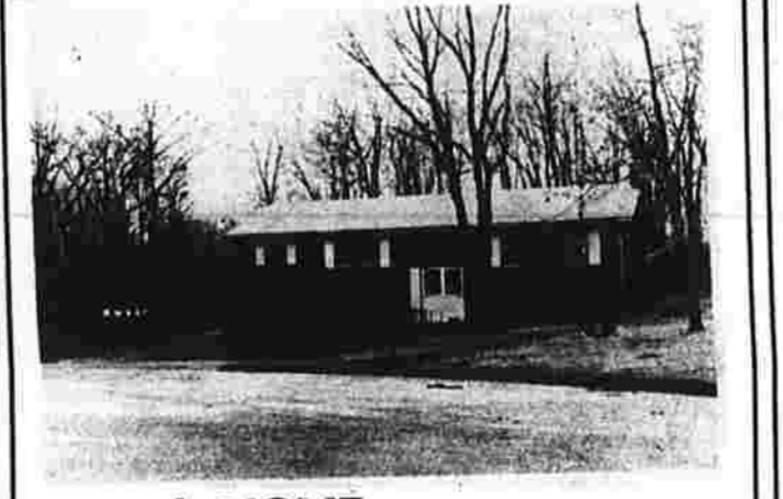
A HOME... FOR THE WHOLE FAMILY