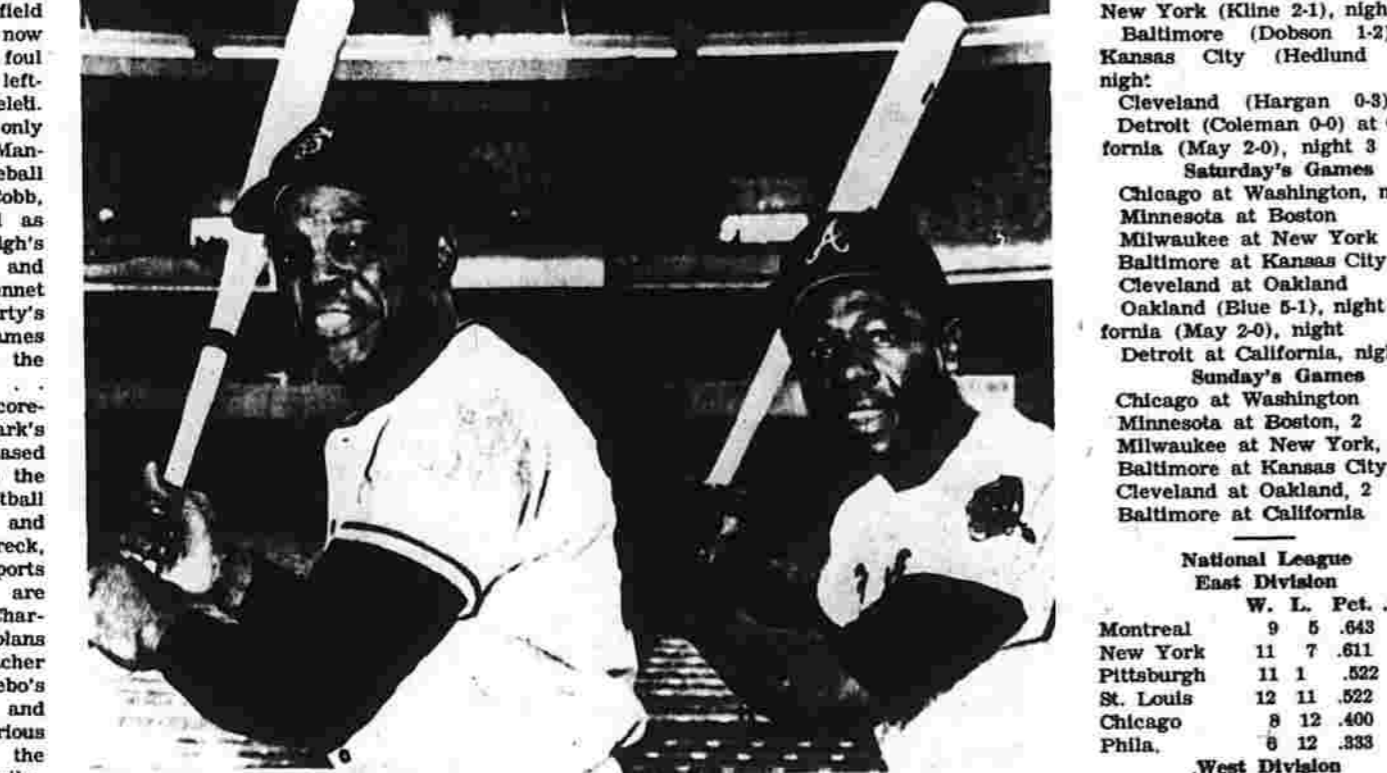
600 CLUB MEMBERS—Willie Mays of the Giants and the Braves' Hank Aaron club with their big guns. When Aaron collected his 600th career home run he joined Mays among the active players in the exclusive club. Mays has 633.

ST. LOUIS (AP) — The New York Mets have left town with a string of victories, and Manager Gil Hodges is happy about both his pitching and hitting. The Mets, 1969 world champions, buzzed in with a 7-3 record and left with an 11-7 mark after flattening the St. Louis Cardinals again Thursday. During the series their bats rang out 48 hits and produced 30 runs while their pitching was choking off the Cards with only four runs. After Ryan, a 4-0-2 right hander, set the Cardinals down on two singles through six innings. He walked eight Cardinals and struck out five before Dan Frisella mopped up by retiring nine of the 10 batters he faced. "I'd say what Ryan did was exceptional," Hodges said, "because he came back after losing the bases and got a strike-out when he needed it in the sixth." "I felt I knew what I was doing," said Ryan, "and I went out with my full tank instead of up and down." The Cardinals' Joe Torre, who set a major league record with a 2.31 earned run average and it dipped more on a combined three-hitter by Nolan Ryan and Danny Frisella. "I'd have to rate his performance exceptional," said Hodges.