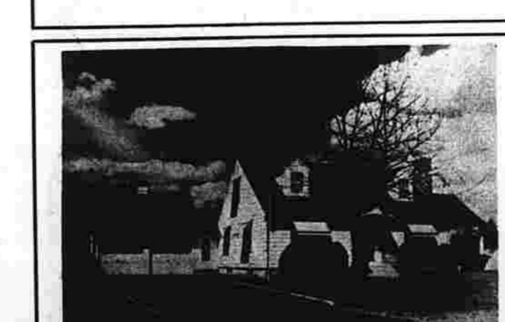
JUMBO SIZE COLONIAL

Offering you 9 large rooms. First floor consists of mud room, extremely large kitchen with family room area, formal dining room, central hall, 1/2 bath and front-to-back living room with fireplace. Second floor has 4 bedrooms and 2 full baths. Full basement completely finished off with windows and sliding glass doors to the rear yard. 2-car garage. Wooded lot in beautiful neighborhood. For appointment call: